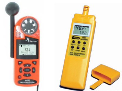
Examples of WBGT monitors